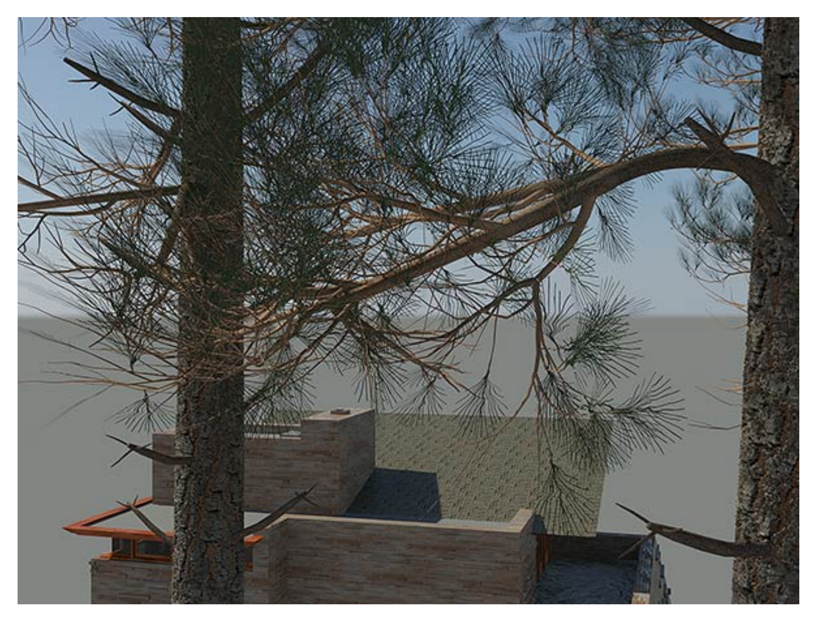
Victor Burgin, Still from Prairie , 2015. Digital projection, 8:03 minutes Courtesy the artist and Cristin Tierney Gallery, New York.

lady dressed for a romantic evening with every element pale and perfect." But, are the unsubtle allusions to whiteness ("pampered lady"; "pale and perfect") incongruous with the photograph's black, presumably working-class protagonist? Like any advertisement, the first instinct is to read the text and image as related, despite their obvious dissonance. Yet this isn't some valorization of the working class, or an elevation of the humdrum daily commute to the status of poetry. We are swept up in beautifully saccharine imagery—we believe the drama—until we discover that the directive to feel moved comes not from true emotion, but from advertising.